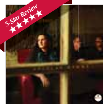
56 Madeleine Peyroux