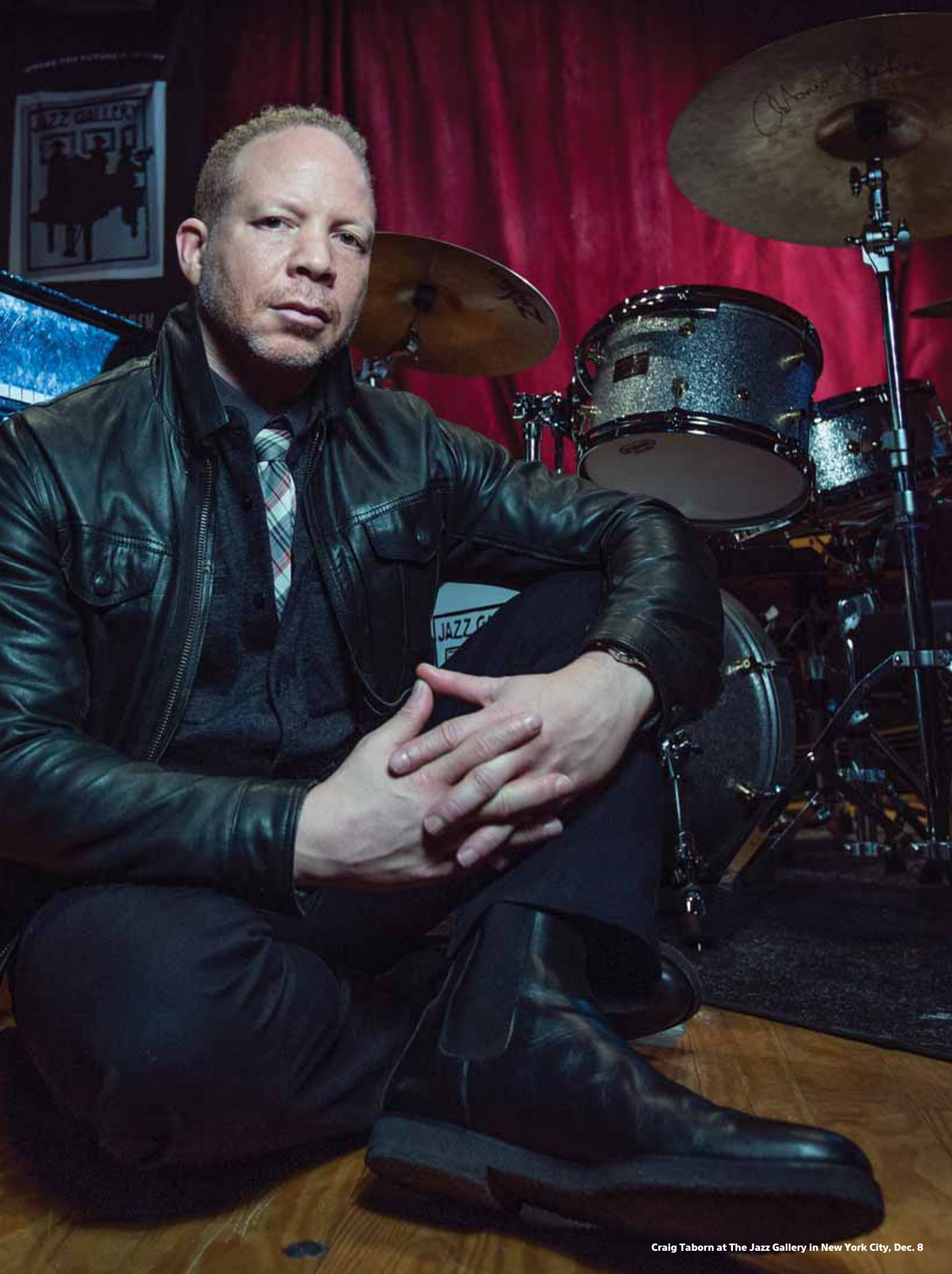
Craig Taborn at The Jazz Gallery in New York City, Dec. 8