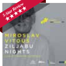
56 Miroslav Vitous