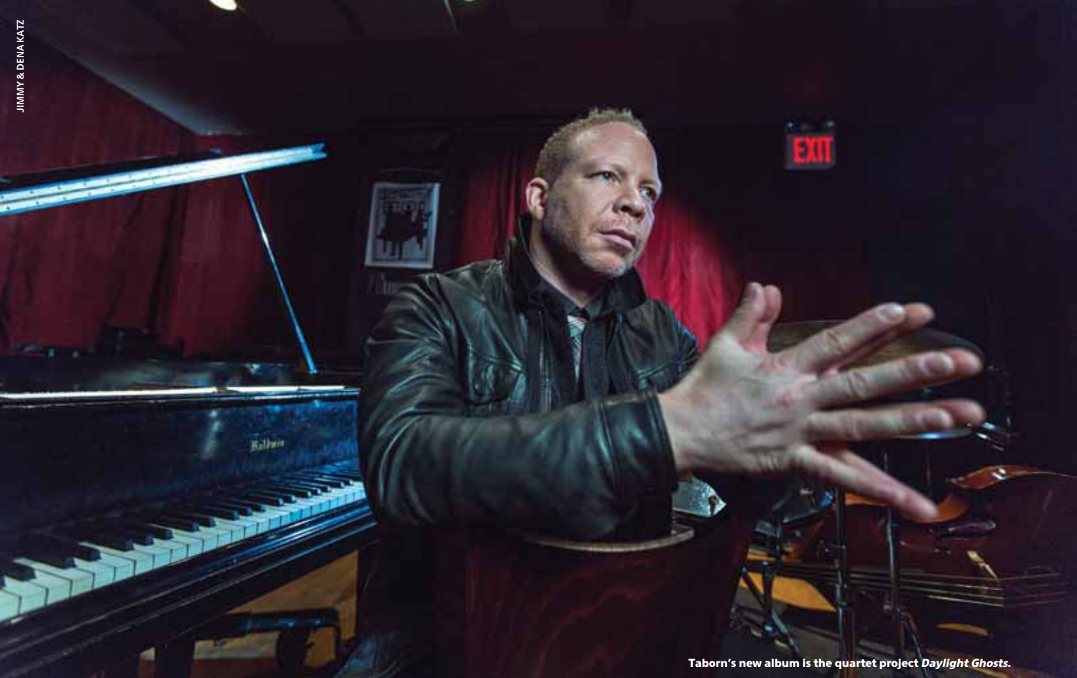
Taborn's new album is the quartet project Daylight Ghosts .

But that intellect doesn't get in the way of beauty. For if there is one defining characteristic to Daylight Ghosts , as well as Taborn's previous ECM albums— Chants and Avenging Angel —and the earlier album Junk Magic (Thirsty Ear), it's sheer beauty.